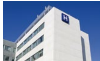
Ideal for air conditioning of civil, public and private buildings.