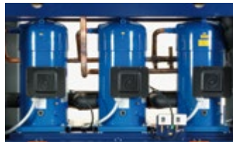
Optimised performance thanks to multiscroll logic.